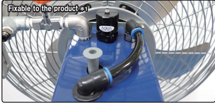
*1 Example of mounting of AFG-18NL