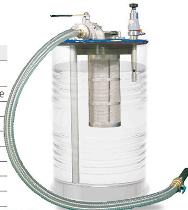
APDQO-FS-i / FF-i

*From April in 2020, change into 1 attached filter with renewal model.