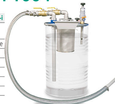
APDQO-FS100-i / FF100-i