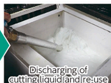
Collection for cutting liquid