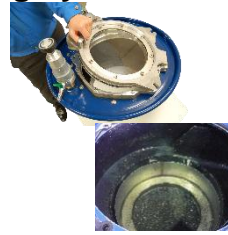
You can check and remove the collected materials through above hatch.