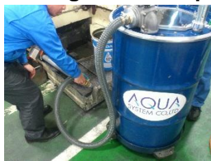
Collecting of cutting oil and chips