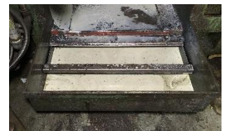
You can reuse the cutting oil without the chips removed.

Finish working time is completed within 5 minutes for 200L Drum Can