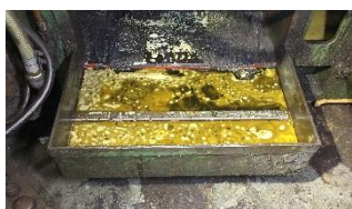
Cutting oil of machine tool

Working flow of collecting cutting oil and chips, using by APDQO-F series